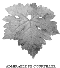
ADMIRABLE DE COURTILLER

During the course of reviewing herbarized grapevine leaves from various sources, leaves from Klosterneuburg designated as Admirable de Courtiller came across. Ampelographic studies on this material, however, showed no similarity with leaves of the true to type Admirable de Courtiller from Geilweilerhof (Fig. 1). According to its leaf characteristics (strong goffering of the blade around